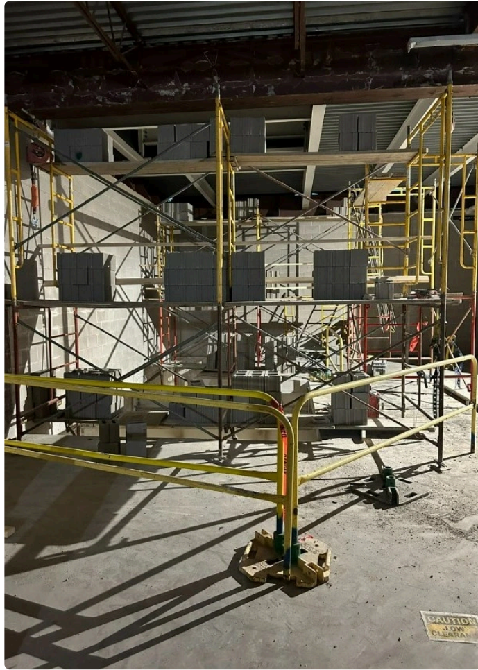
Concrete Masonry Unit for Freight Elevator Shaft