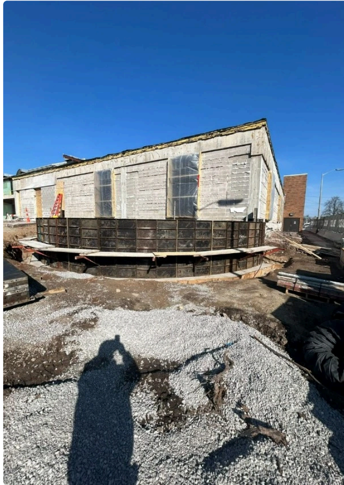
Children's Terrace Foundation