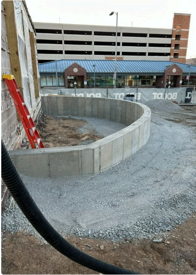
Children's Terrace Foundation