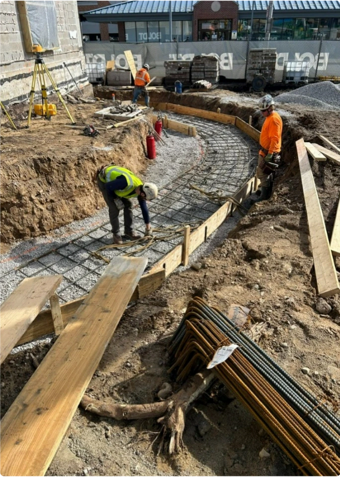
Children's Terrace Footings