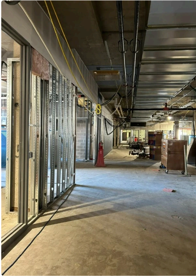
Ground Level Mechanical, Electrical and Plumbing Install