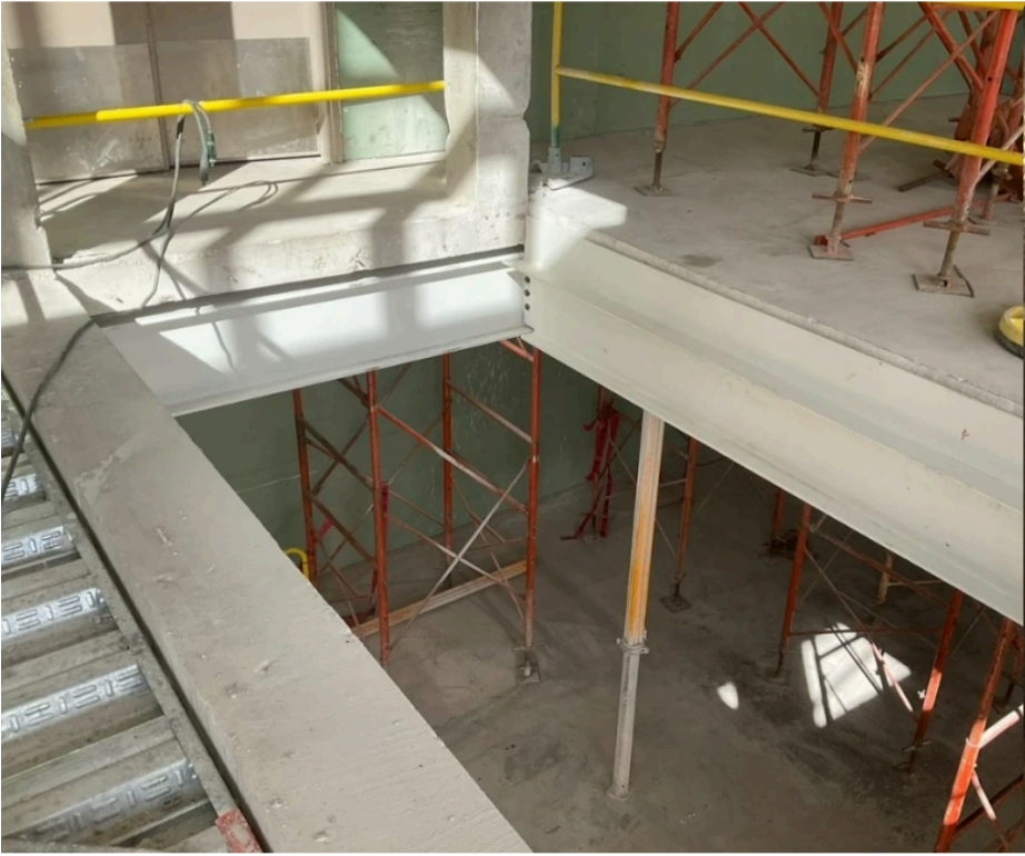
In-fill Former Elevator Shaft