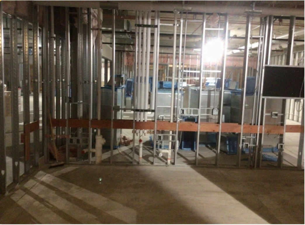
Room Framing on Lower Level